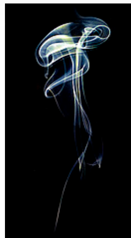
Smoke Trails

Pictures from the Welshot Imaging Flickr Group